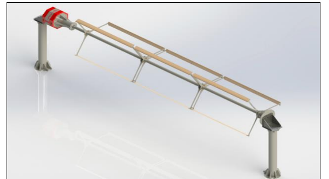
Figure 2.0: Windspire IV Horizontal Placement: The Windspire system is 30 ft wide and 5 feet tall to avoid violation of FAA regulation for safety and security.

The wind turbine of choice to satisfy these requirements is the Windspire IV that is a cylindrical structure put together with three bars in the borders and two circular pieces, one on the top and one on bottom. This structure is lifted a few feet off the ground to be at the elevation of useful wind. Recuperated energy then is directly placed back into the airport electrical grid.